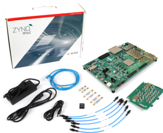
Part Number: EK-U1-ZCU111-G

The platform includes an evaluation board, cables, filters, documentation, verified reference design, and includes the XM500 RFMC balun transformer add-on card to support loopback evaluation and signal analysis.